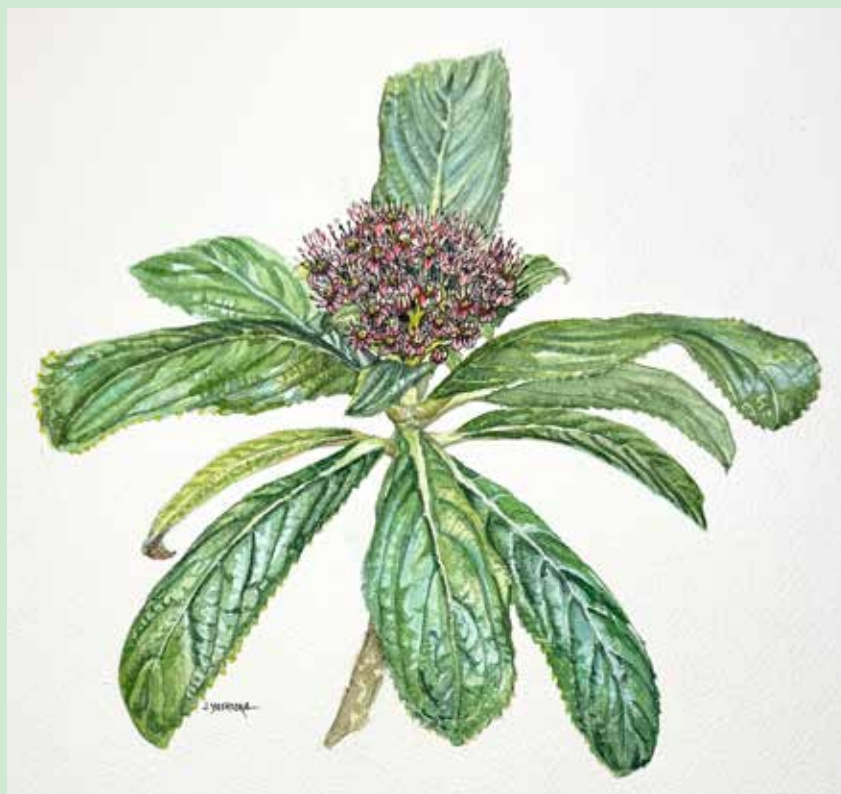
Kanawao ( Broussaisia arguta )

Uses: Kanawao are utilized in many ways, not just by humans but also by many endemic birds and insects. Kanawao fruits are quite delicious (I encourage you to taste one next time you see a juicy bunch!) and are commonly eaten by endemic Hawaiian forest birds. The underside of Kanawao's thick leaves make a great home to the nananana makaki'i (Theridion grallator or happy face